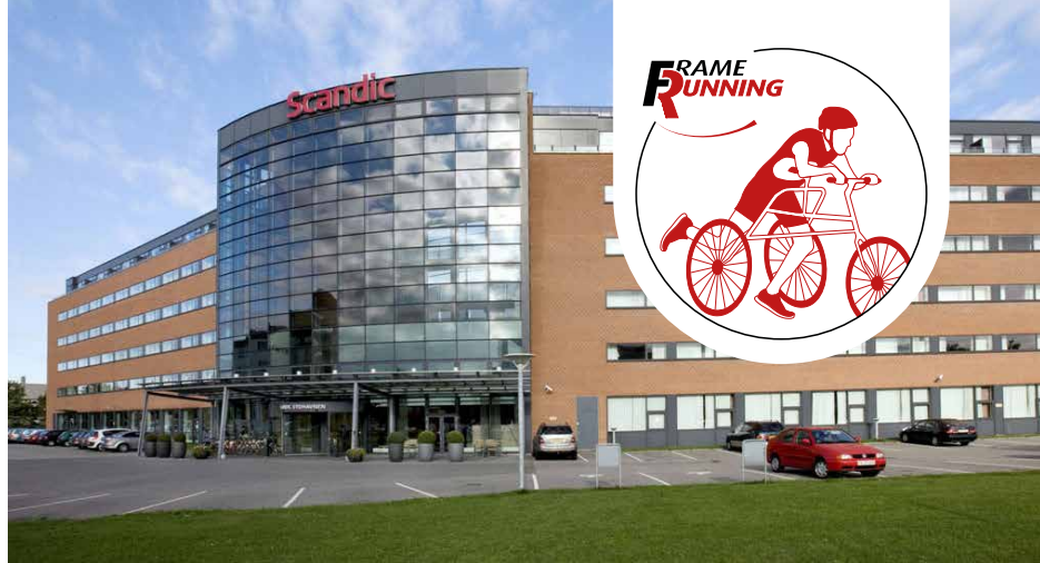
Hotel Scandic Sydhavnen